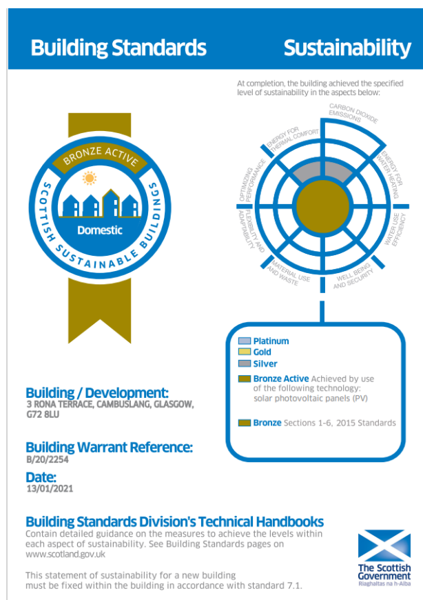
Example of Sustainability Label for a Housing project completed as part of the Housing led Whitlawburn Regeneration in 2022.