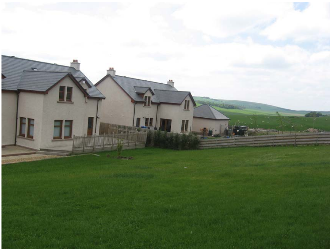
Photo 10 Timber fencing between numbers 1 and 2 West Millrigg.