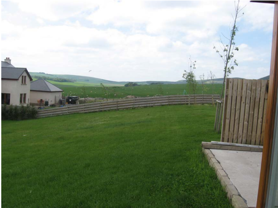
Photo 11 – 1.8 metre high timber fencing and concrete area associated with garden building.