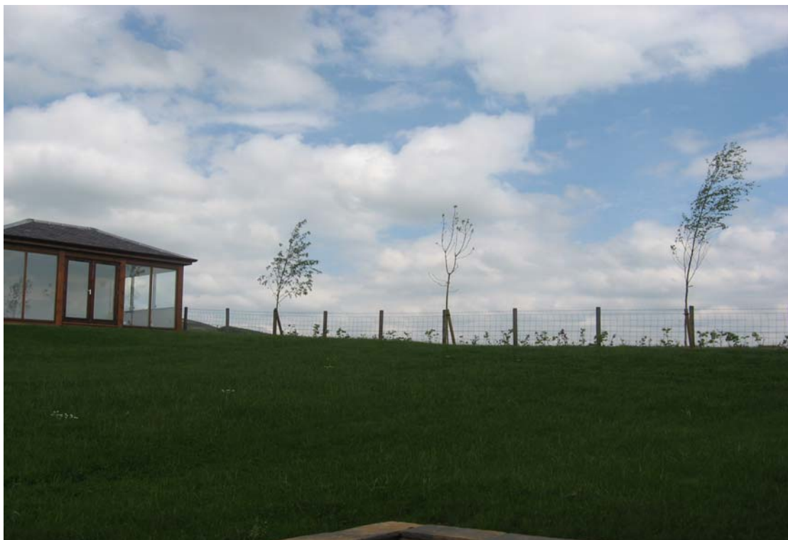
Photo 8 Looking north-west from rear of number 2 West Millrigg up to the garden building.