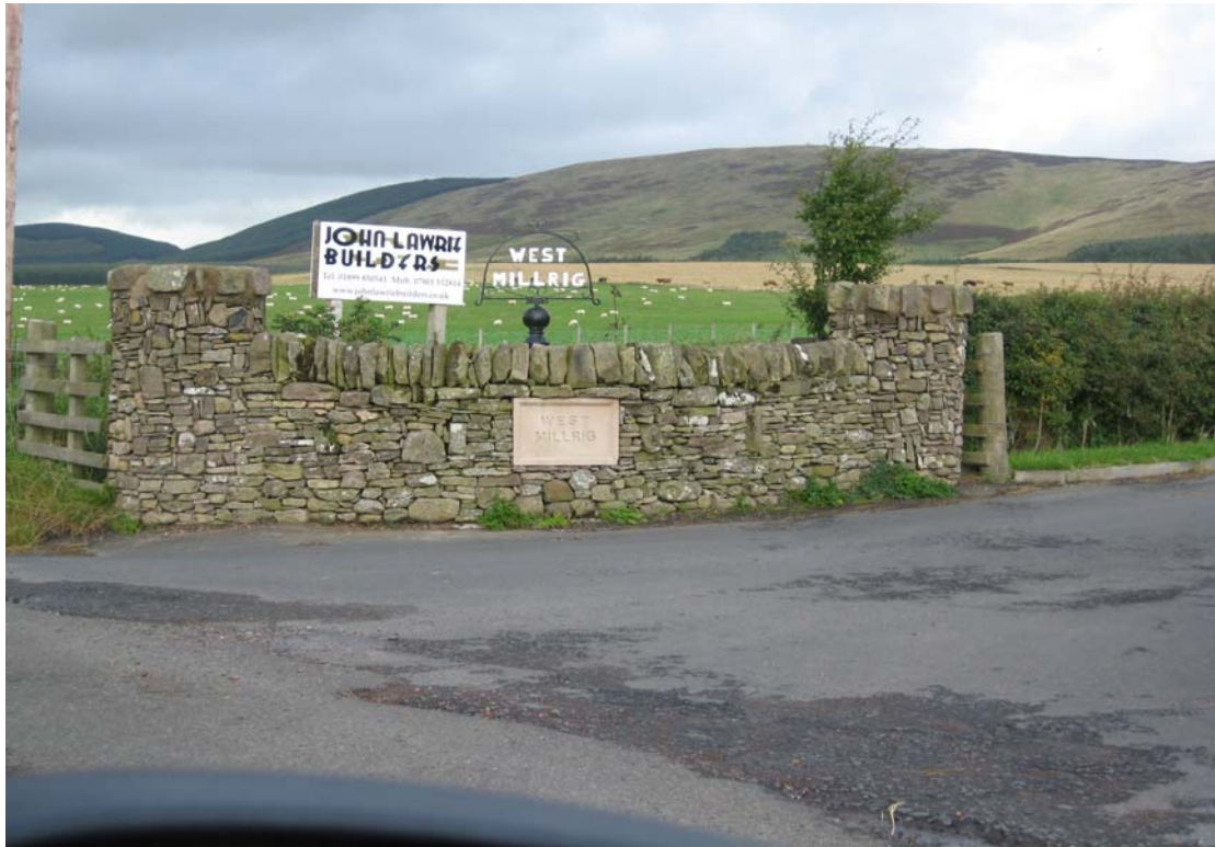
Photo 5 Section of feature wall at the access to West Millrig