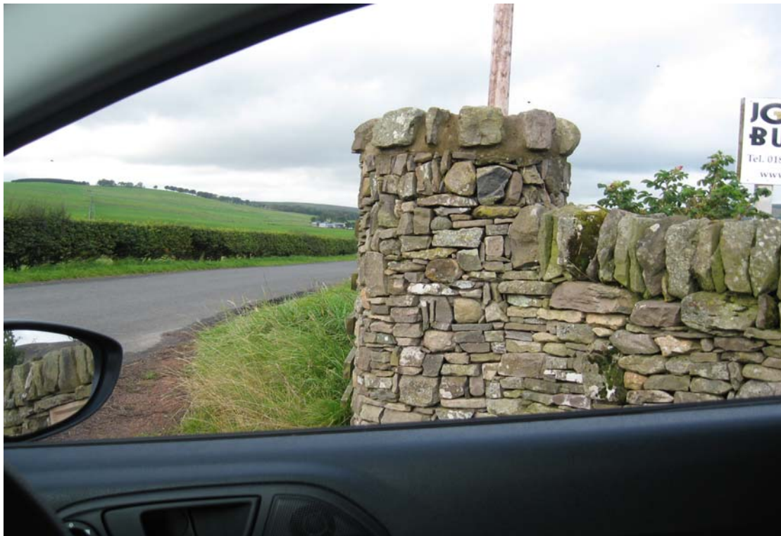
Photo 6 Looking west when exiting the site onto the B7055.