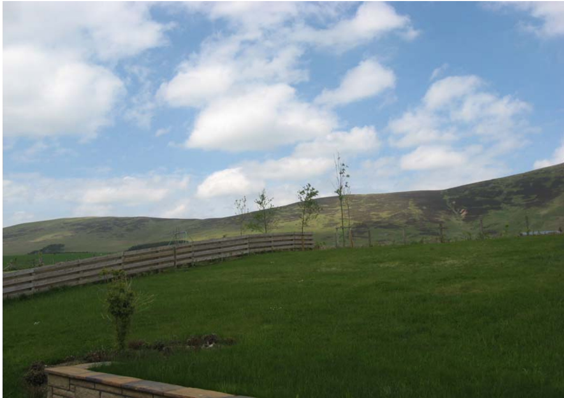
Photo 9 Timber fencing,from rear of number 2, West Millrigg looking north