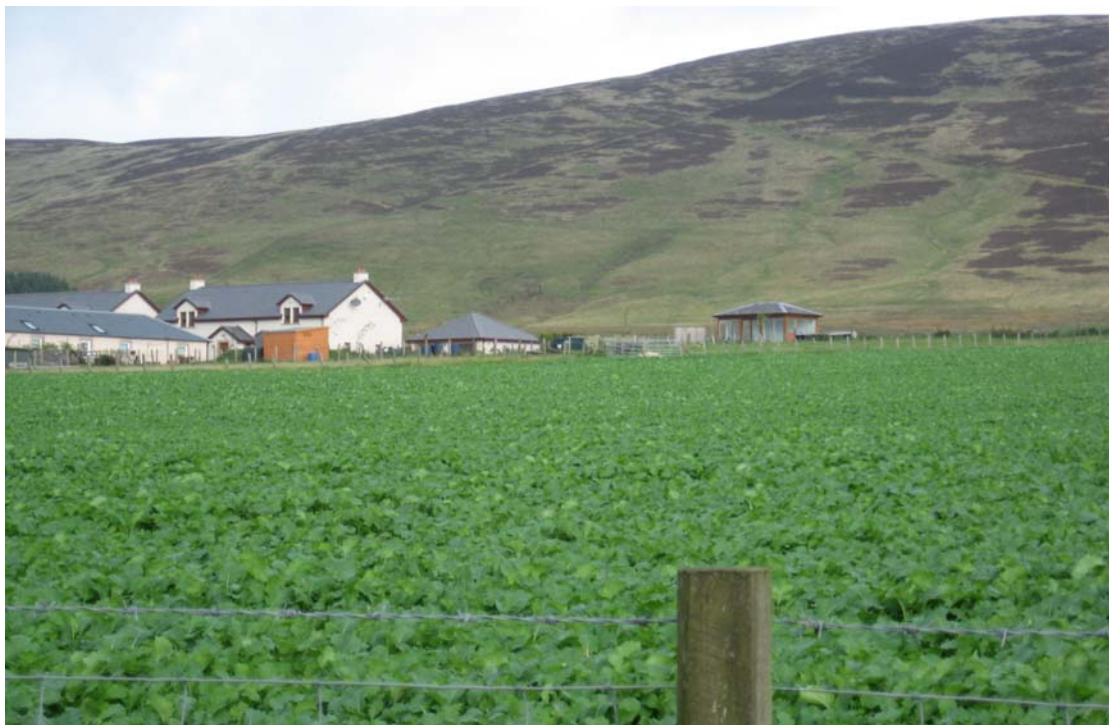
Photo 2 View from B7055 to number 2 West Millrigg showing glazed garden building.