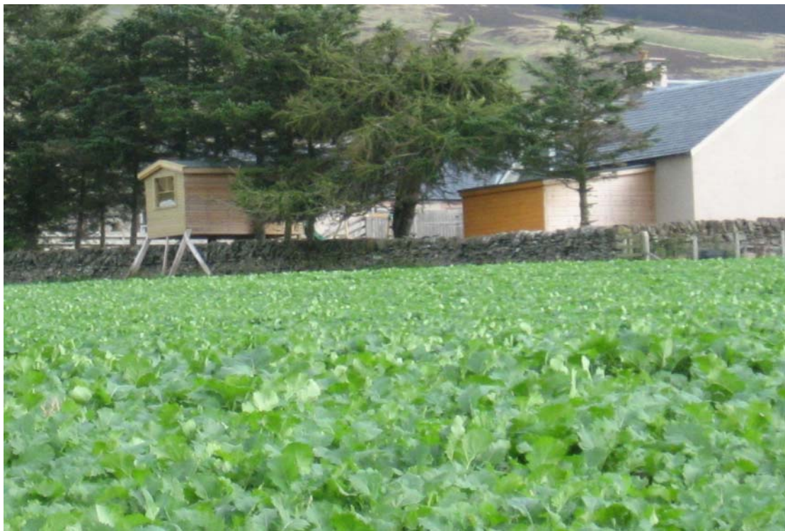
Photo 4 An example of unauthorised buildings which have been erected elsewhere at West Millrigg