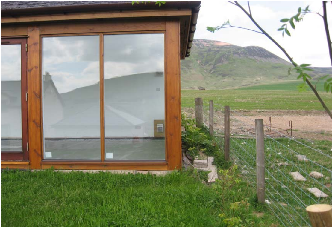
Photo 3 Front elevation of garden building and its concrete base, showing proximity to the boundary fence.