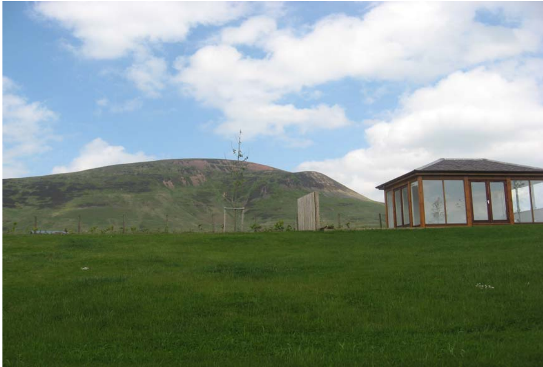
Photo 7 Glazed garden building and 1.8 metre screen fence.