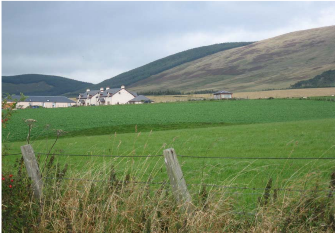
Photo 1 View westward from B7055 to West Millrigg