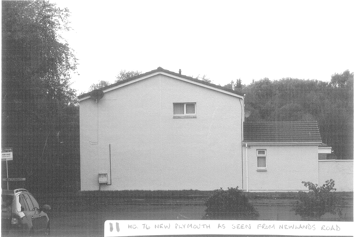
11 NO. 16 NEW PLYMOUTH AS SEEN FROM NEWLANDS ROAD