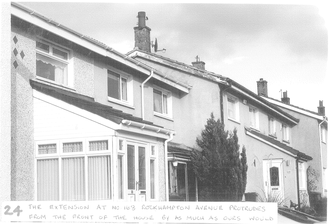
24 THE EXTENSION AT NO.168 ROCKHAMPTON AVENUE PROTRUDES FROM THE FRONT OF THE HOUSE BY AS MUCH AS OURS WOULD