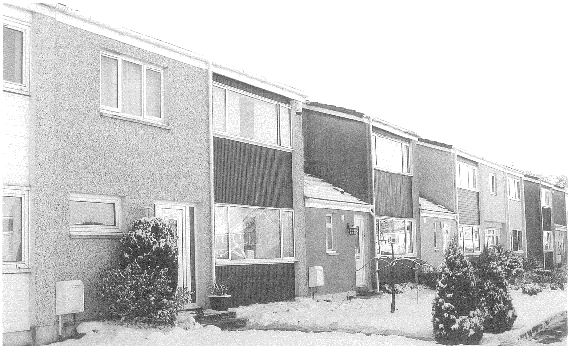
6 'UNIFORM STREET FRONTAGE'? - NOS 15,13,11,9,7 WELLINGTON : DOUBLE HEIGHT, SINGLE HEIGHT, SINGLE HEIGHT, DOUBLE HEIGHT, NONE