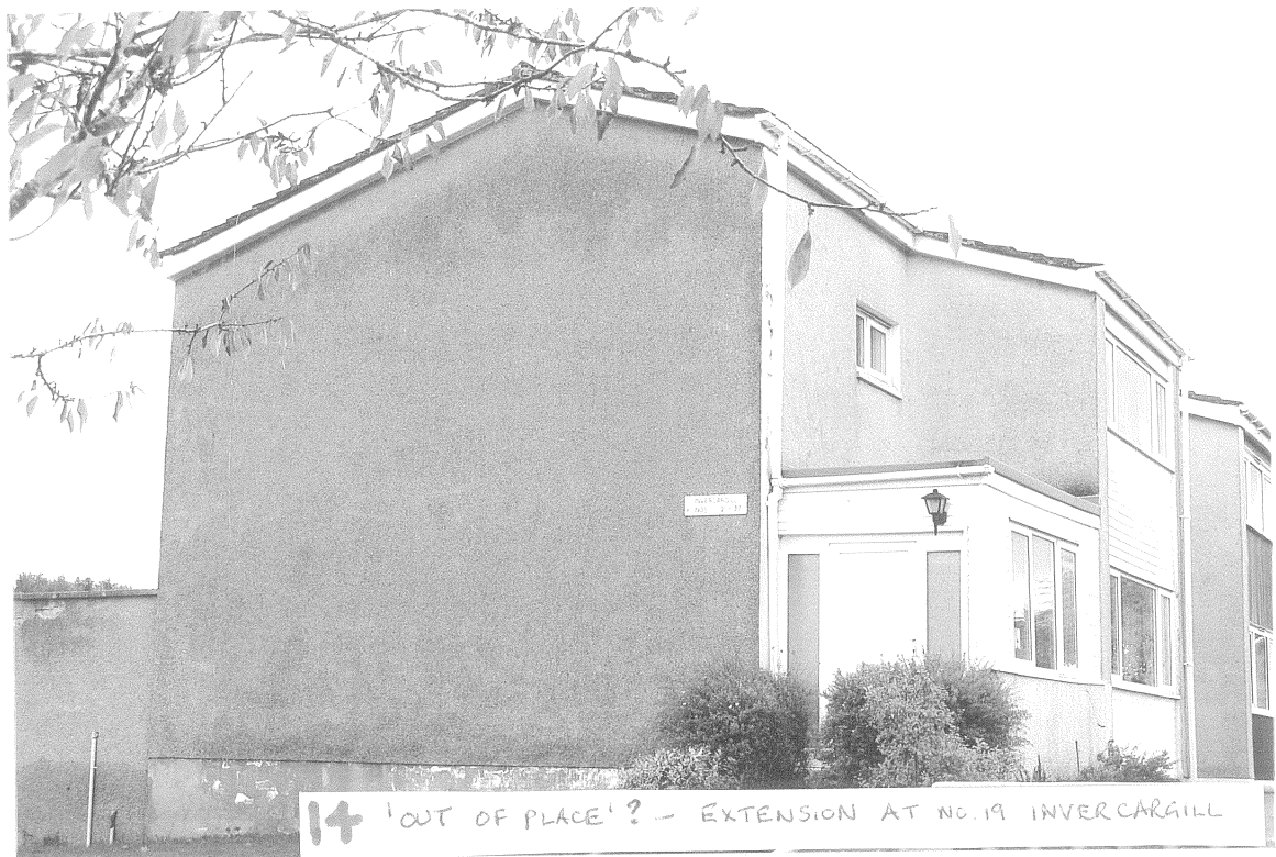
14 'OUT OF PLACE' ? - EXTENSION AT NO.19 INVERCARGILL