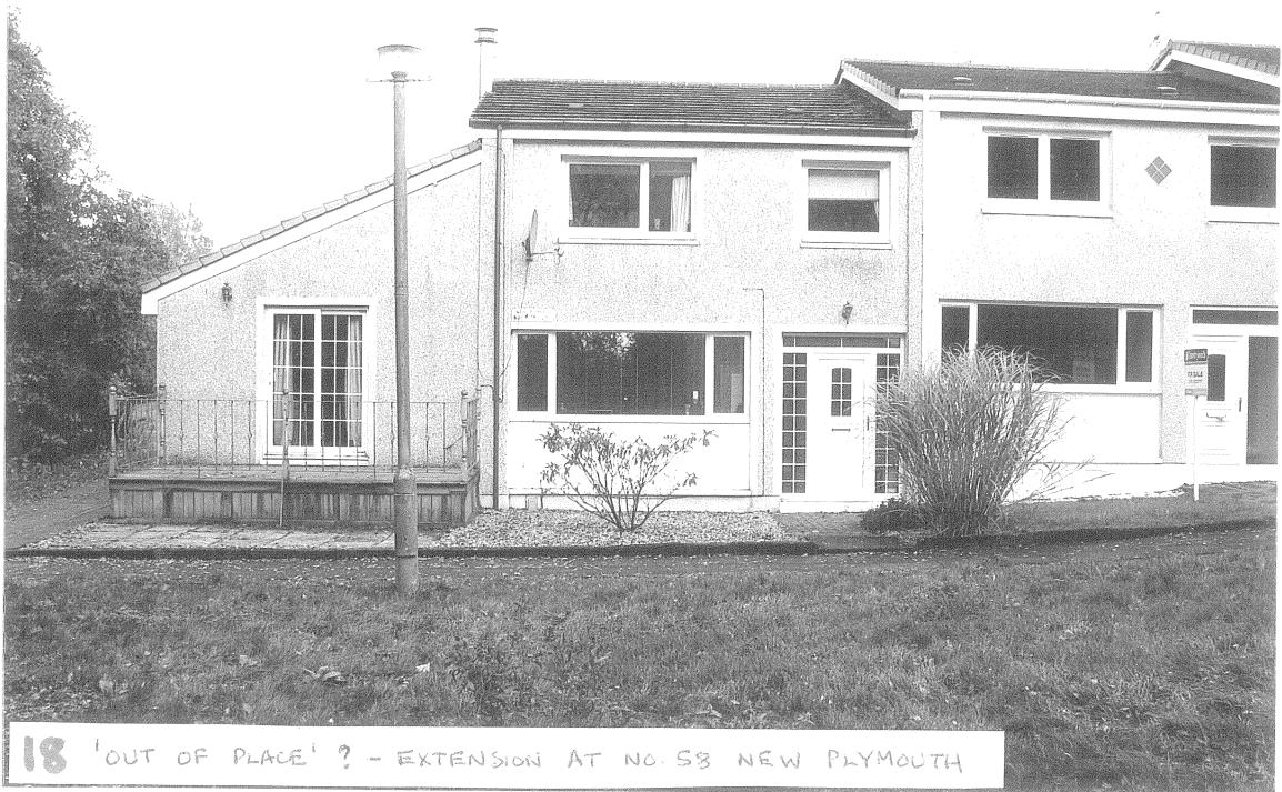
18 'OUT OF PLACE' ? - EXTENSION AT NO. 58 NEW PLYMOUTH