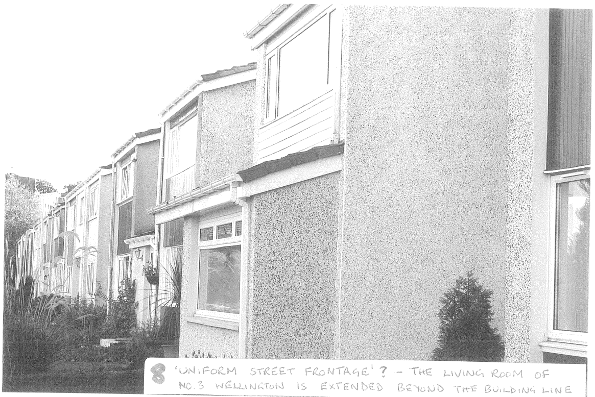
8 'UNIFORM STREET FRONTAGE'? - THE LIVING ROOM OF NO. 3 WELLINGTON IS EXTENDED BEYOND THE BUILDING LINE