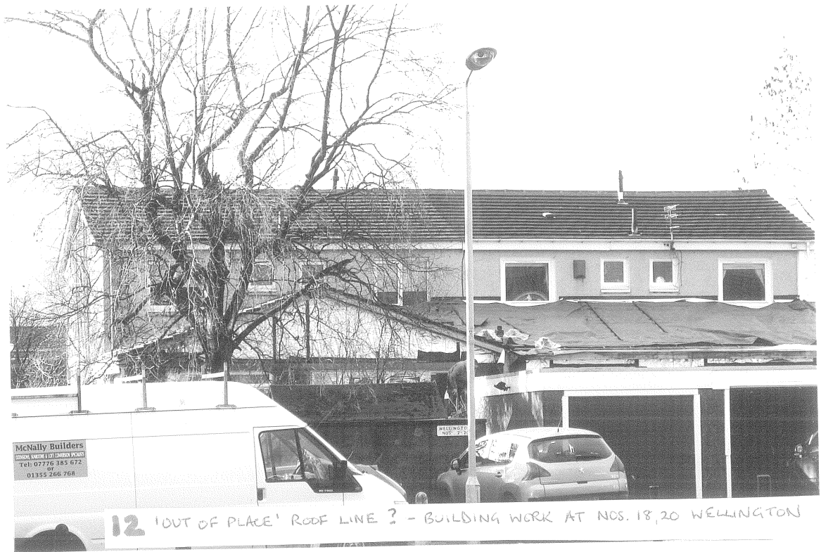
12 'OUT OF PLACE' ROOF LINE ? - BUILDING WORK AT NOS. 18, 20 WELLINGTON