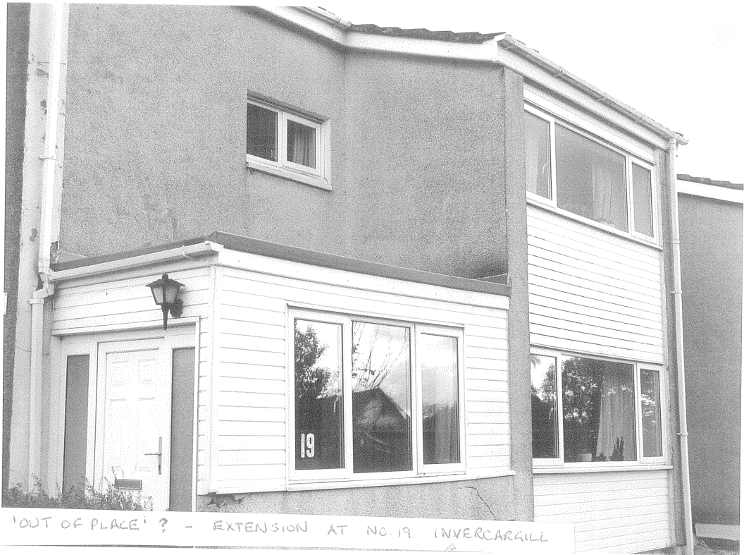
13 'OUT OF PLACE' ? - EXTENSION AT NO.19 INVERCARGILL