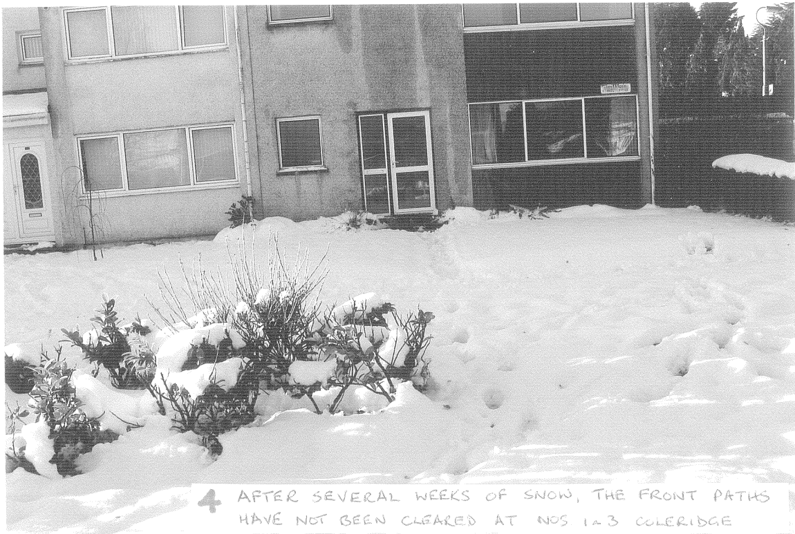
4 AFTER SEVERAL WEEKS OF SNOW, THE FRONT PATHS HAVE NOT BEEN CLEARED AT NOS 1A3 COLERIDGE