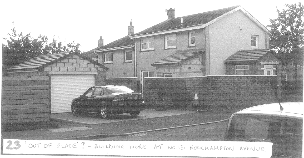
23 'OUT OF PLACE'? - BUILDING WORK AT NO.131 ROCKHAMPTON AVENUE