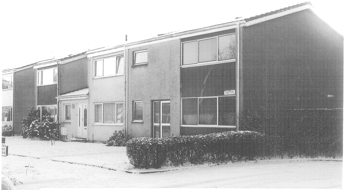
5 'UNIFORM STREET FRONTAGE'? - THE TERRACE ROW OPPOSITE US AT NOS 1,3,5 COLERIDGE : DOUBLE HEIGHT INFILL, SINGLE HEIGHT INFILL, NONE