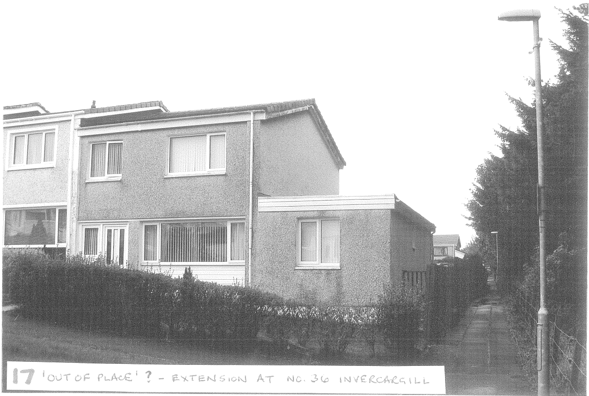
17 'OUT OF PLACE' ? - EXTENSION AT NO. 36 INVERCARGILL