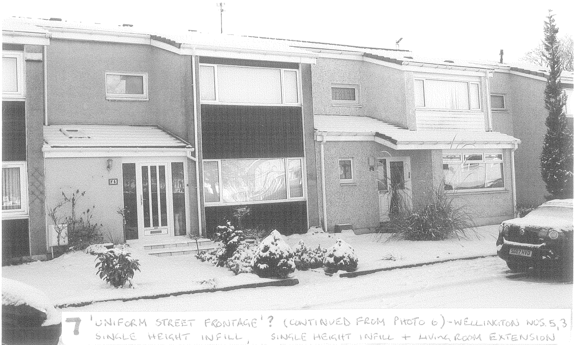
7 'UNIFORM STREET FRONTAGE'? (CONTINUED FROM PHOTO 6) - WELLINGTON NOS. 5, 3 SINGLE HEIGHT INFILL, SINGLE HEIGHT INFILL + LIVING ROOM EXTENSION