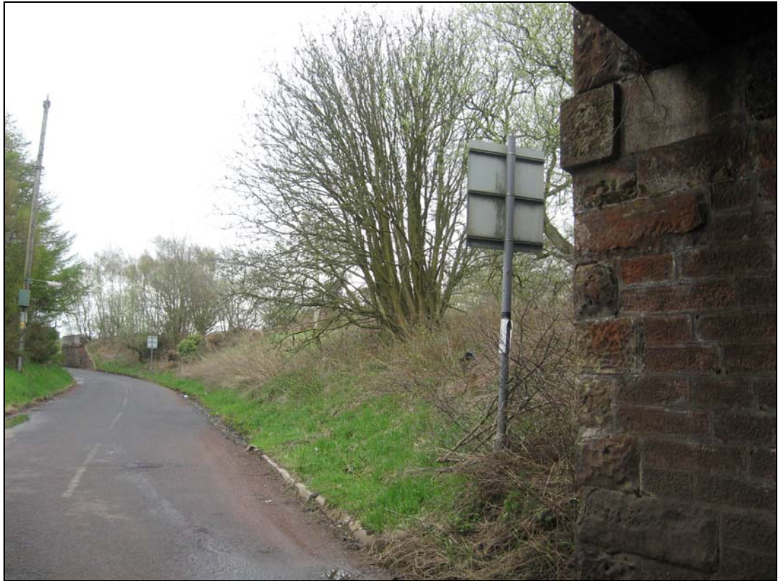
Photo A – View of Appeal Site taken from the western edge of the site boundary underneath the Glasgow – Lanark Railway Line Bridge (Hagholm Road, Cleghorn)