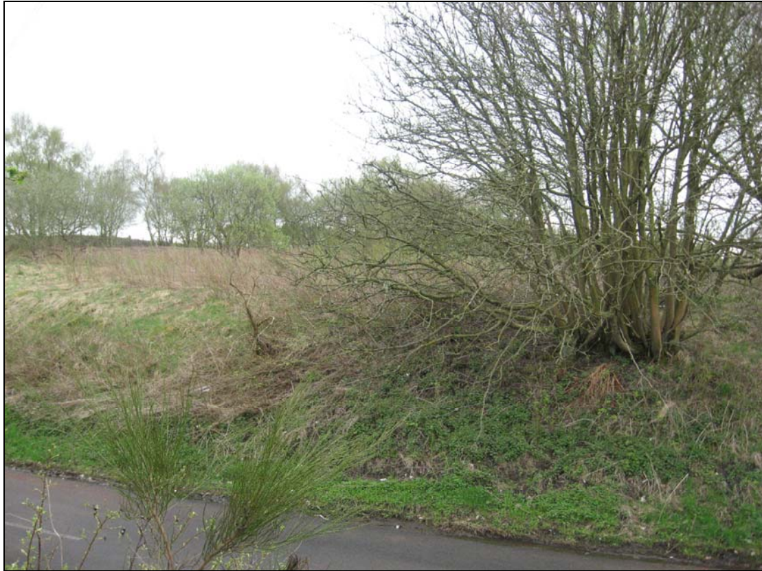
Photo C – View of Appeal Site taken from the north –western side opposite the Site