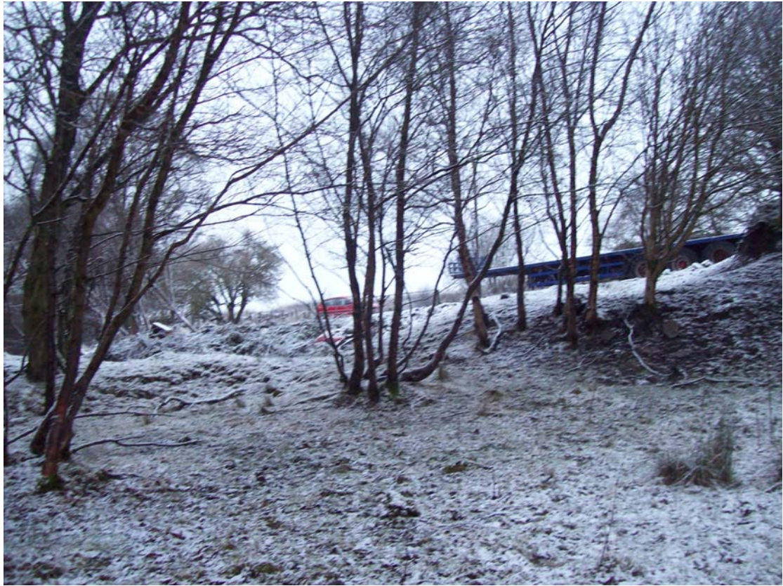
(Photo C) Proposed vehicular access from site downwards towards the east. (Taken from the east)