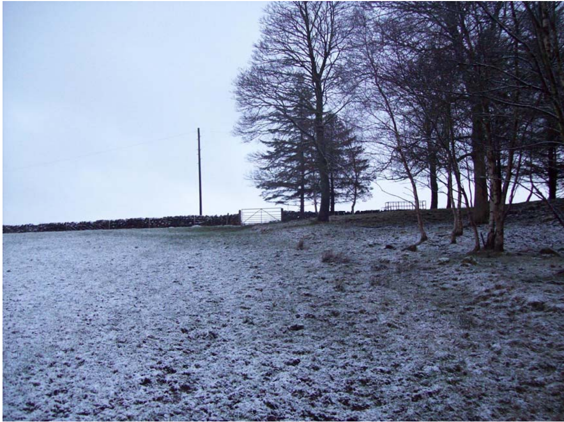
(Photo A) Area of proposed new vehicular access looking up the hill from the east.