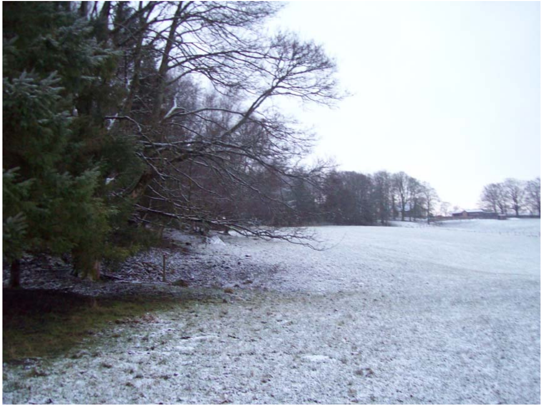
(Photo B) Area of proposed new vehicular access running north-east to south-west, located to the south of the site.