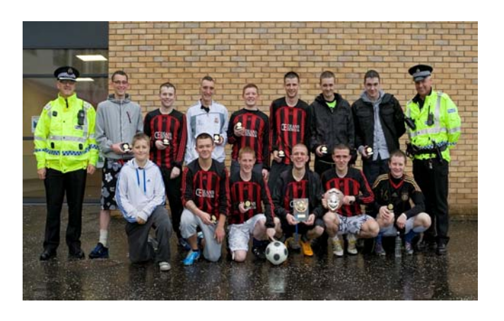
The Circuit won the 'Choose Life Shield'

'Move the Goalposts' is a multi-partnership diversionary initiative that utilises football as a 'tool' to divert young people from gang participation, acts of violence and anti-social behaviour. It has been ongoing for over three years operating four nights per week, Thursday to Sunday. Following demand from attendees a 'Community League' was formed, some participants are pictured below.