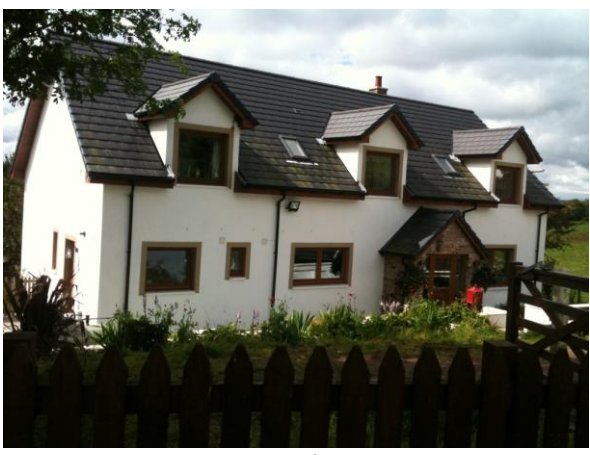
The new property at Bankfoot clearly not a one for one substitution.