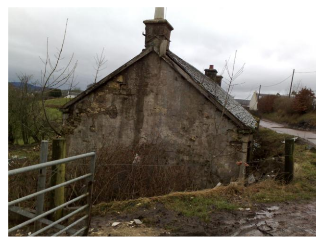
Moat Cottage formerly Bankfoot.

1.1 'non domestic outbuilding' - we do not believe that this is accurate. The building is the original farm house built before the building of Moat House (this has been confirmed by the Lanark Archaeological Society). It has not been used as a house for 30 years + being used for storage – this is the same as Bankfoot Cottage – see attached picture of Bankfoot and picture of the Coach house at Moat House.