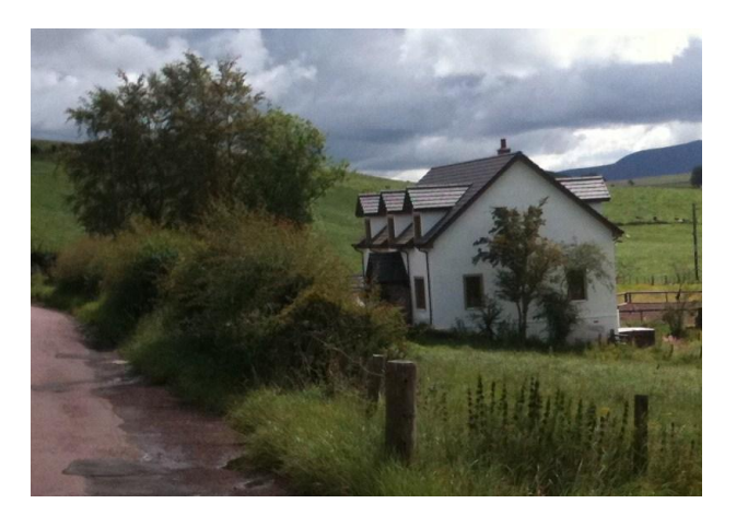
Additional rooms and at least double the floor area resulting in a net increase in traffic flow.