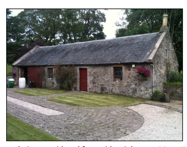
Property being considered for residential use at Moat House.

We would like the following comments to be read in response to the second Statement of Observations made by South Lanarkshire Council Planning issued 25<sup>th</sup> July 2011.