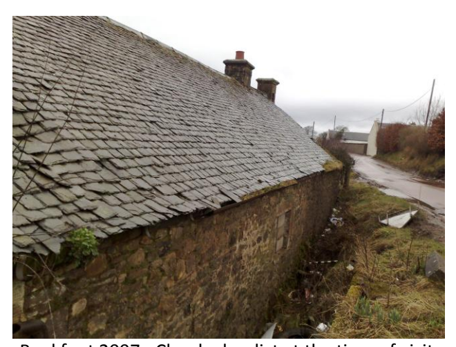
Bankfoot 2007 - Clearly derelict at the time of visit.