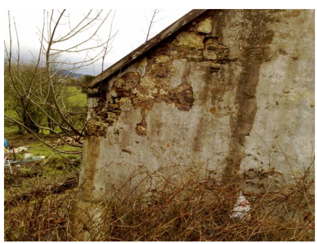
Bank foot 2007 - tree growing out of the wall of the house.