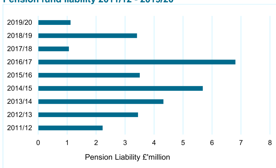
Exhibit 5 Pension fund liability 2011/12 - 2019/20

Source: Lanarkshire Valuation Joint Board audited Annual Accounts 2011/12 -2019/20