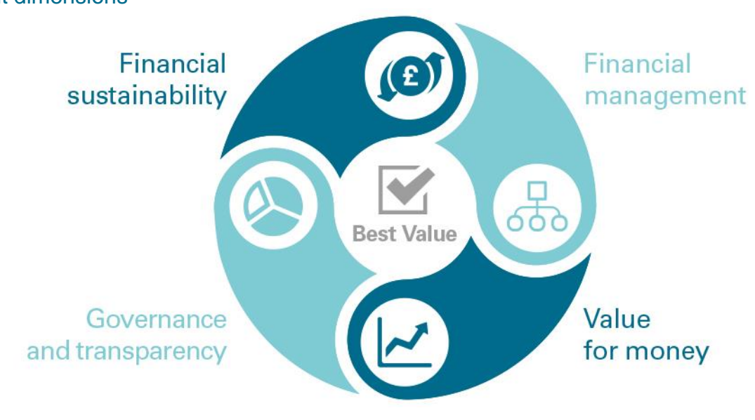
Exhibit 7 Audit dimensions

28. Our audit is based on four audit dimensions that frame the wider scope of public sector audit requirements, exhibit 7. Our conclusions on these four dimensions will contribute to an overall assessment and assurance on best value.