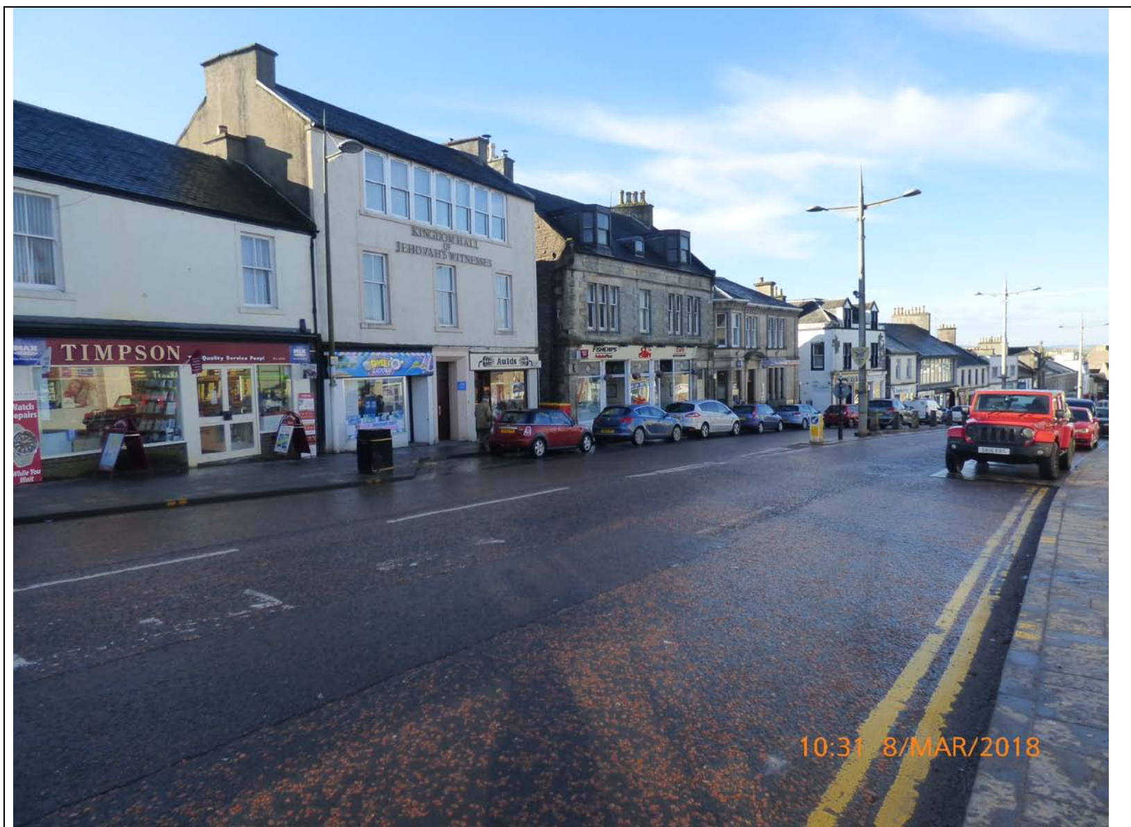
Photo 11 – Looking west down High Street towards shop front, taken from north side of street. ( taken 8/3/2018)