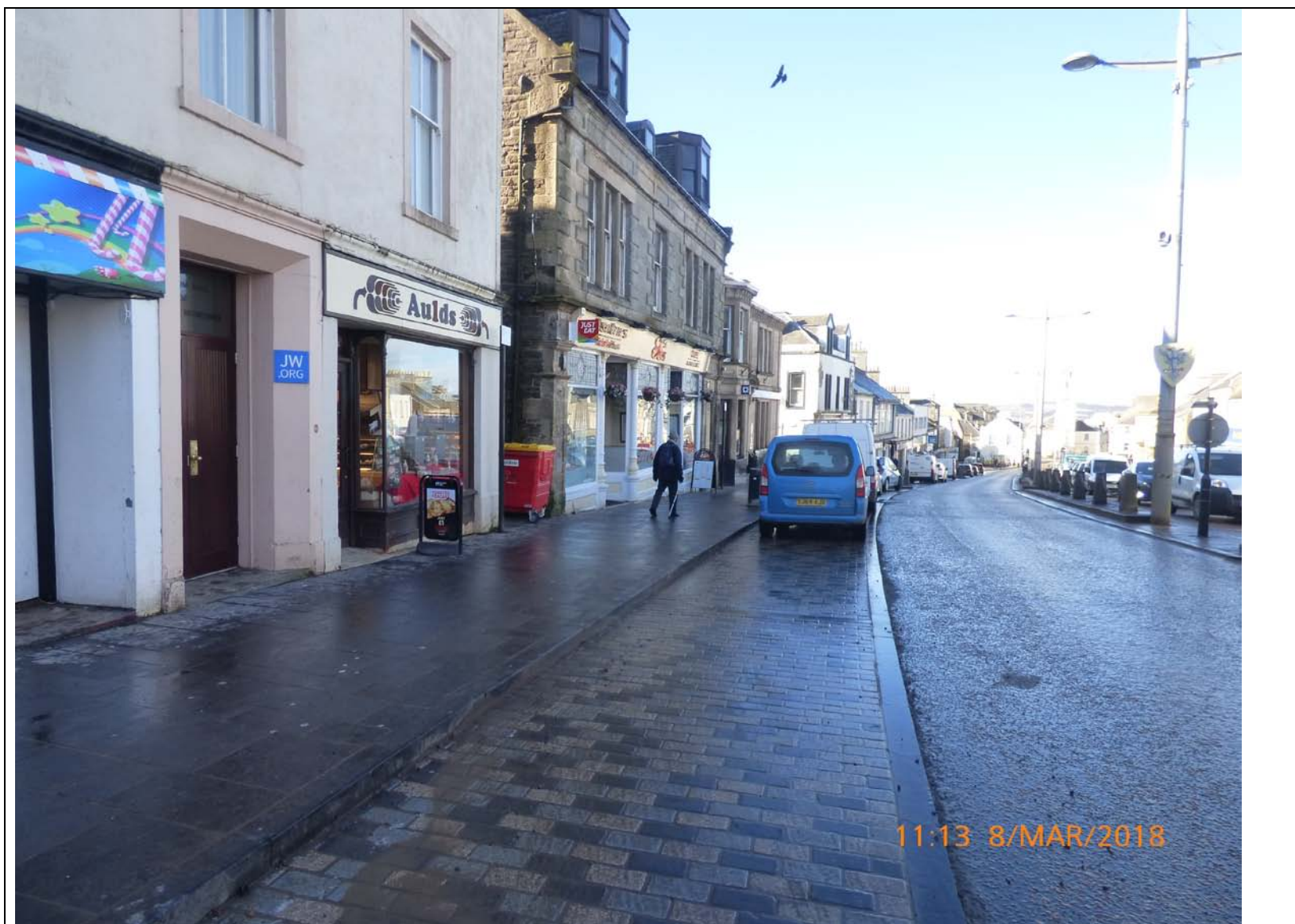
Photo 12 - Looking west down High Street towards shop front, taken from south side of street. ( taken 8/3/2018)