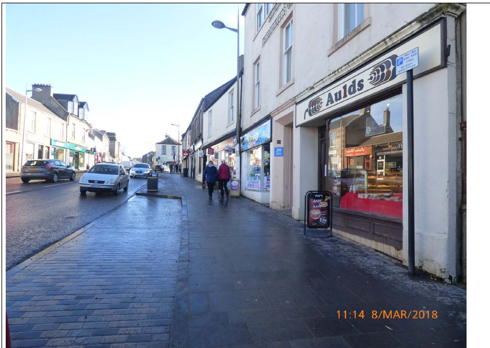
Photo 13 - Looking east up High Street towards shop front, taken from south side of street ( taken 8/3/2018)