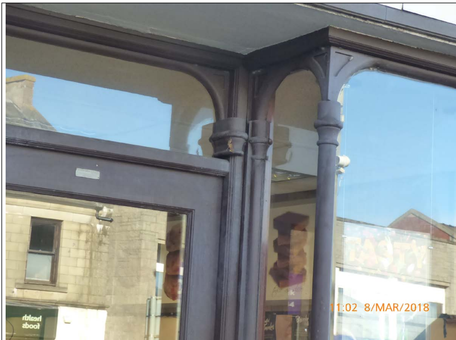
Photo 3 - Curved fanlight and window details with turned wood detailing.( taken 8/03/2018)