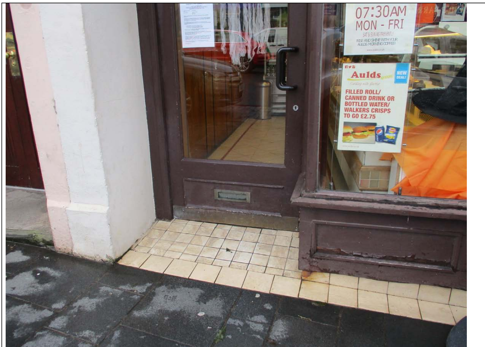
Photo 6 - Tiled entranceway, timber door with kickboard and timber paneled stallriser ( taken 12/10/2017)