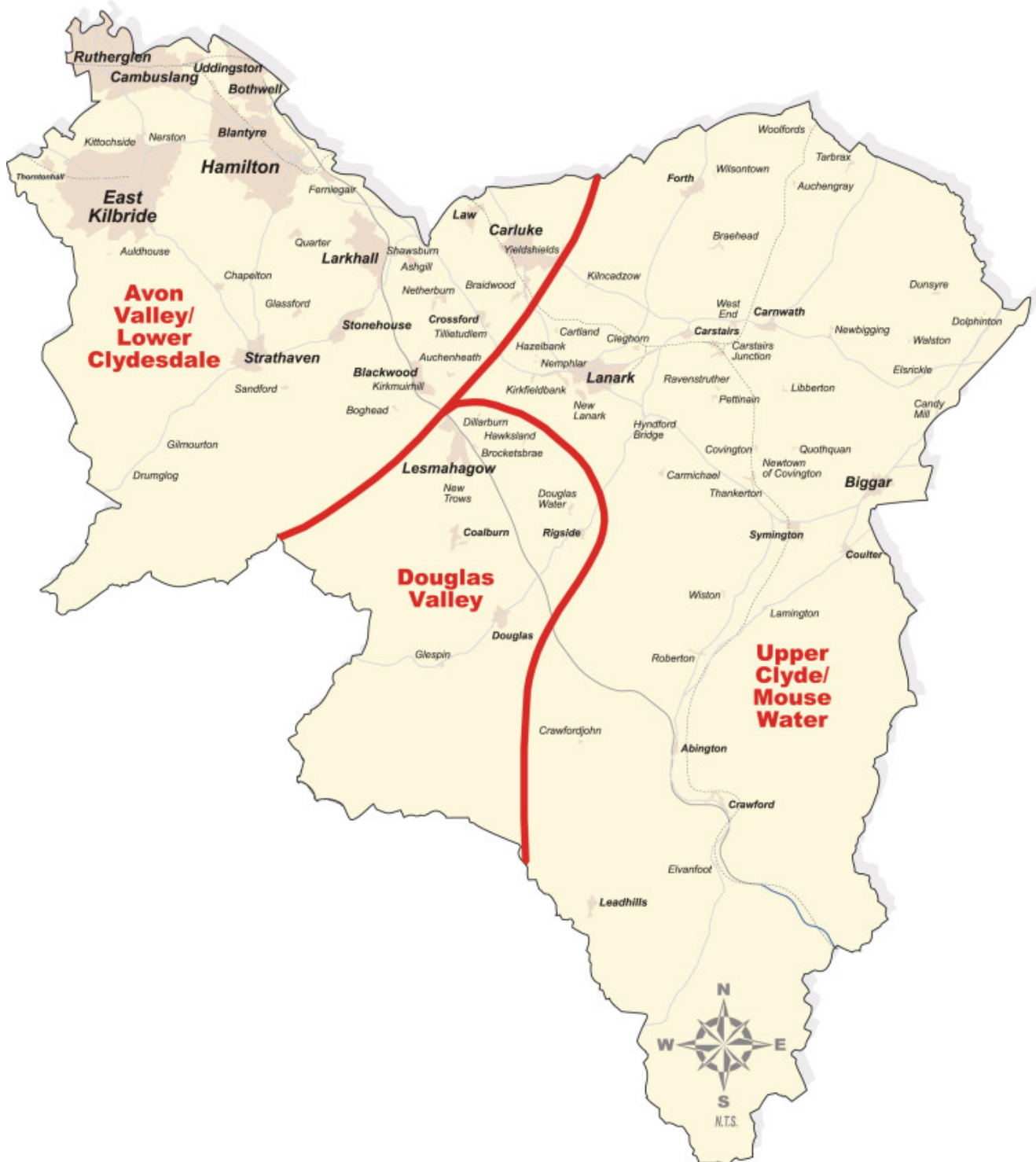
Figure 3.1 Consultative forum areas for the South Lanarkshire Minerals LDP