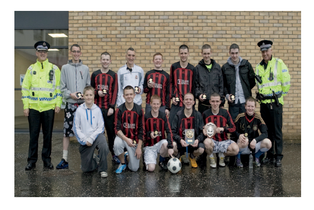
The Circuit won the 'Choose Life Shield'

'Move the Goalposts' is a multi-partnership diversionary initiative that utilises football as a 'tool' to divert young people from gang participation, acts of violence and anti-social behaviour. It has been ongoing for over three years operating four nights per week, Thursday to Sunday. Following demand from attendees a 'Community League' was formed (some participants are pictured below).